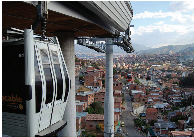
Departing the station.

Both station design and cabin size and style are similar to those on the Línea K system.